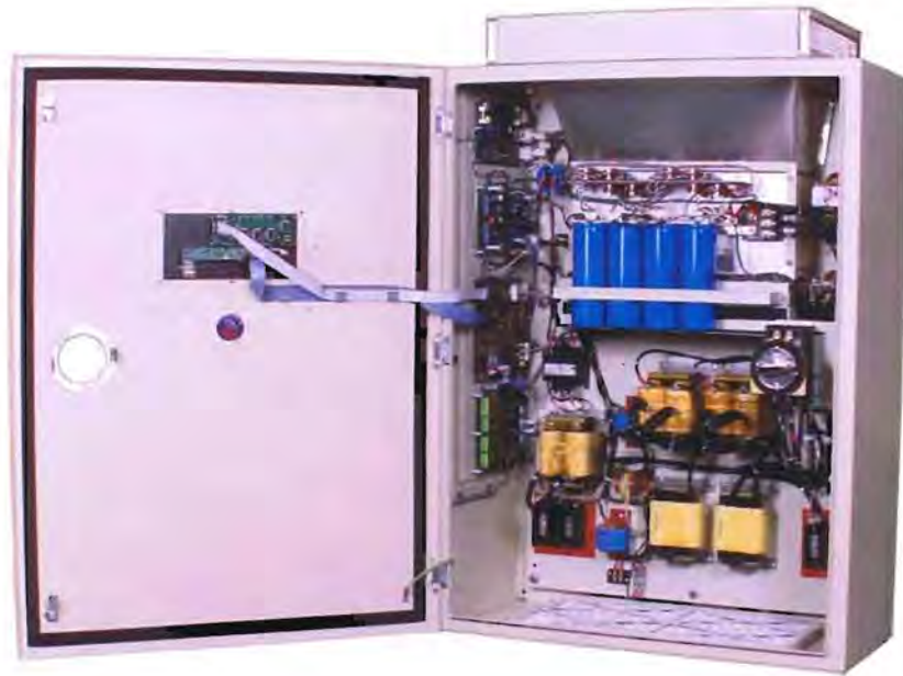
Air-Cooled Induction Heating Inverter

Mesta Electronics, Inc. was founded in 1977 as a consulting firm to meet the demands for inverter designs and innovative industrial controls. Mesta has designed and manufactured a variety of state-of-the-art power conditioning systems and industrial controls for companies including IBM, Motorola, Westinghouse and Siemens. Today, the company has evolved into a high-tech design and quality manufacturing firm specializing in sophisticated high-frequency Induction Heating Inverters (IHI), Uninterruptible Power Supplies (UPS) and a newly developed active harmonic filter, the Mesta Digital Power Manager (DPM).