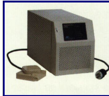
Mesta Medical Unit provides a four-receptacle outlet to facilitate connection of monitoring equipment.

A separate built-in transformer isolates your critical load from electrical leakage. Its special "Fail safe" design maintains utility power to the critical load, even if the UPS is accidentally shut down or damaged.